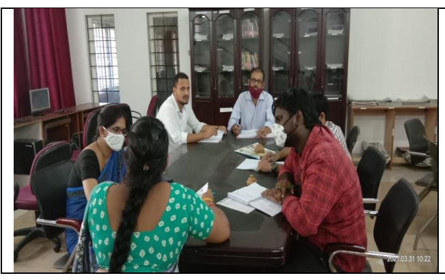
LIBRARY COMMITTEE MEETING