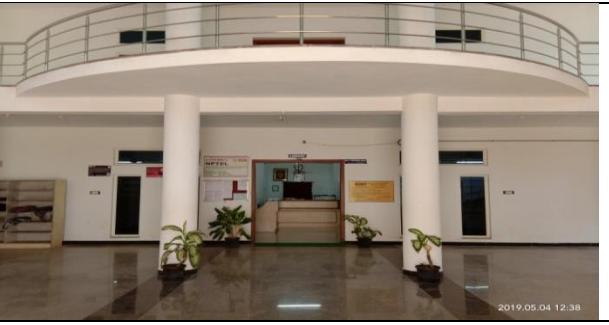
CENTRAL LIBRARY VIEW