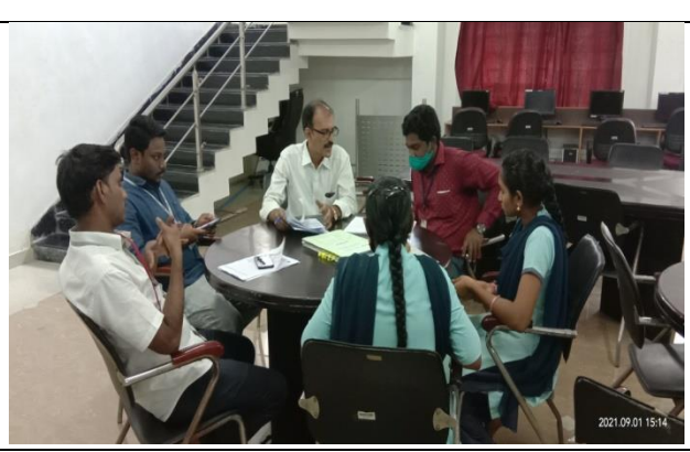
LIBRARY COMMITTEE MEETING