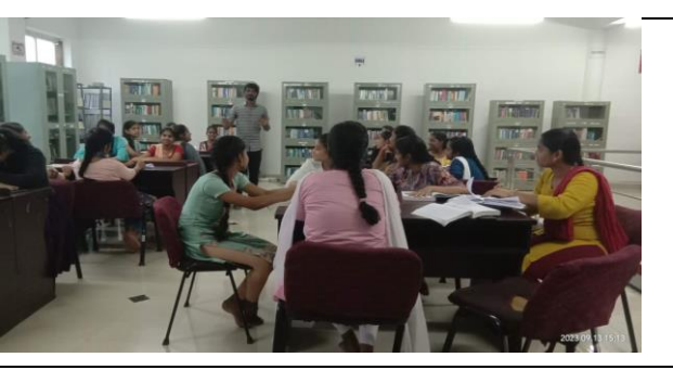
LIBRARY ORIENTATIOIN PROGRAMME