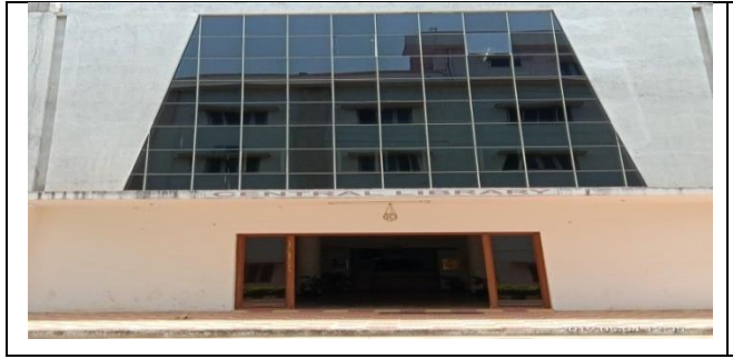
CENTRAL LIBRARY MAIN BUILDING