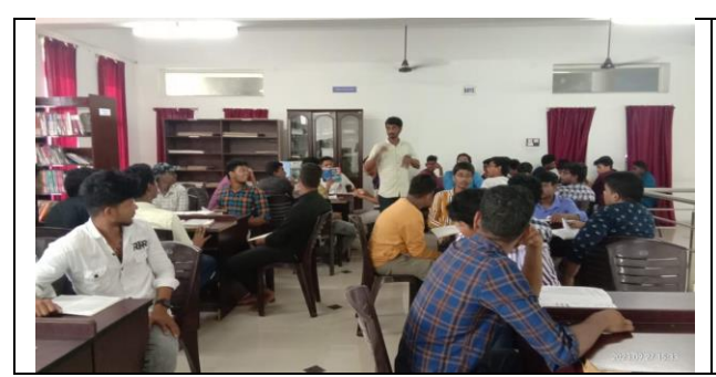
LIBRARY ORIENTATIOIN PROGRAMME